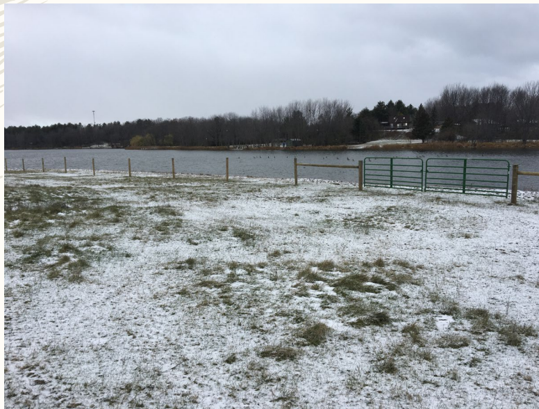
Livestock Exclusion Fence and Buffer Strip